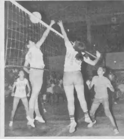
Volleyball - Puerto Rico/Aruba